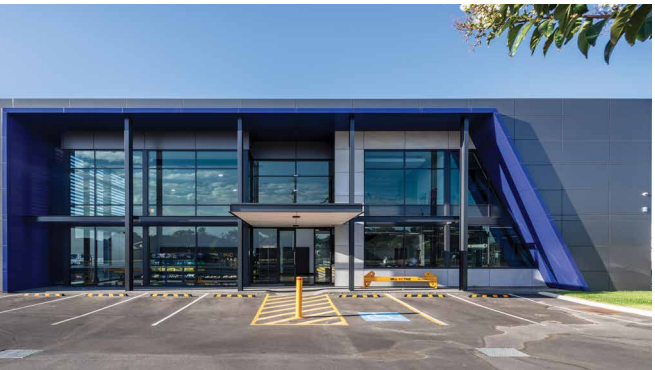
224 Welshpool Road Warehouse Office | Value $2.1 million