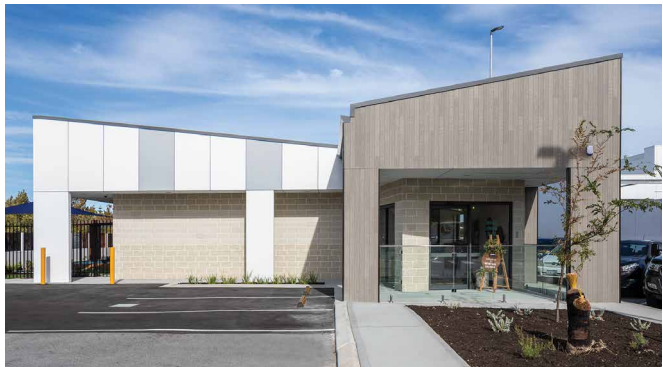
Nido Childcare Centre, Secret Harbour Childcare | Value $2.4 million