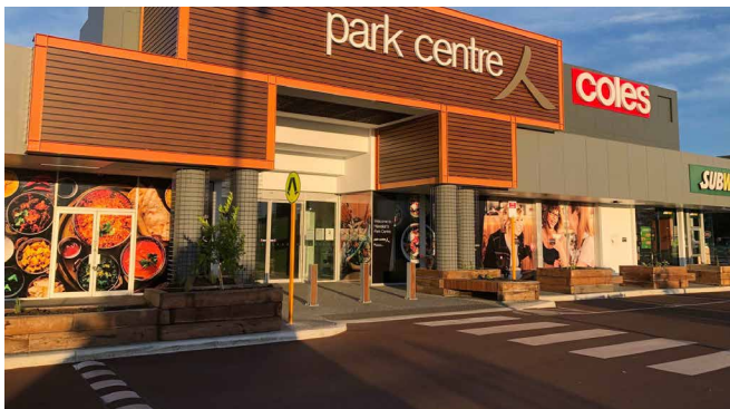
Park Centre Upgrade, East Vic Park Retail | Value $1.4 million