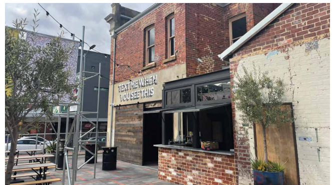
Ruin Bar Northbridge Heritage and Conservation | Value $2.7 million