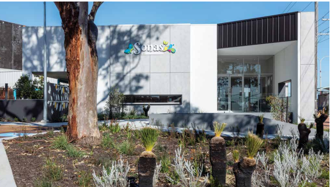
Sonas Childcare Centre, Wanneroo Childcare | Value $2 million