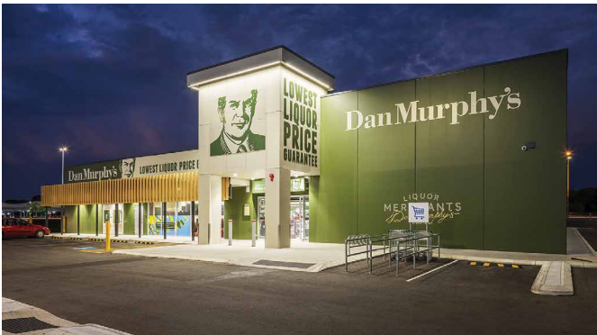
Dan Murphy's, Secret Harbour Retail | Value $2.4 million

Examples of TRICON's current and completed projects.