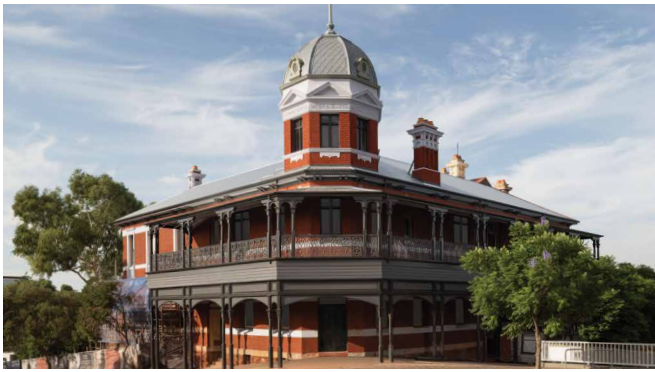
Royal George Hotel, East Fremantle Heritage and Conservation | Value $3 million